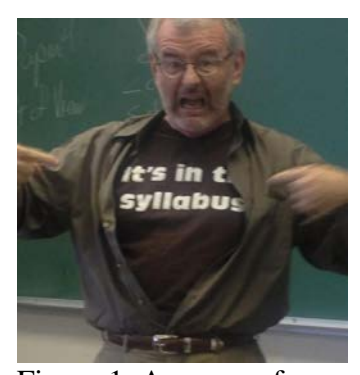
Figure 1. Angry professor

The rest of this syllabus describes the principles, policies, assignments, materials, and schedule of the course. It also points you to resources that will help you succeed in the course and take care of yourself and your classmates. Whenever you have a question about the course, first consult the syllabus before contacting me or the Graduate Student Instructor. Please don't make me be this guy: