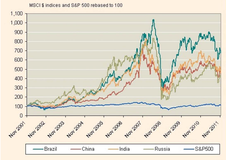
Figure 3 BRICs equities relative to S&P 500.

investment patterns in the emerging markets funds industry. (Wansleben, 2013). The very promotion of O’Neill’s research note by one of the most important firms in the financial markets, precisely at the time when this firm was divesting its investments away from the Western world, the even more optimistic follow-up reports by that very same firm (in 2004 and 2007), 10 the popularization of the concept by the Financial Times and the Beyondbrics blog (in which O’Neill participates), the various creative plays with the term to include other emerging economies and, in the end, the emergence of cooperation among the BRICs themselves (the annual BRIC summits) were part and parcel of the process of economic exuberance that has channelled interest and capital toward these economies over the last decade (and has fuelled their bubble-like growth). As Gillian Tett (2010) has remarked, the BRIC concept caught on in part thanks to Goldman’s extensive executives’ network, who found in it ‘a snappy way of discussing strategy. Better still, unlike phrases such as “emerging markets” or “developing world”, BRICs did not sound patronising, or unpromising; it was neutral, strong, politically correct.’ But through these powerful relays, some of which Goldman Sachs actively sought to control and some of which escaped it, the firm’s power to categorize (and, therefore, institute and qualify) reverberated throughout the economy. As Pierre Bourdieu